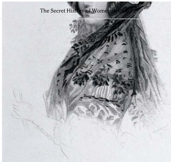
An engraving of Ada Lovelace, the first computer programmer.