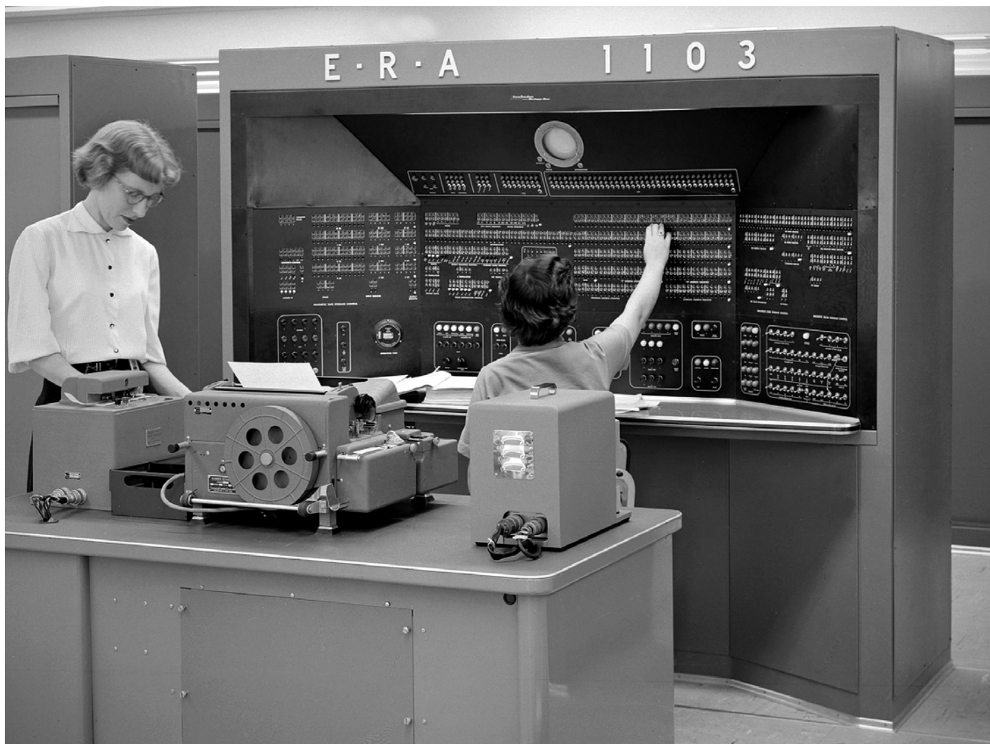
An E.R.A./Univac 1103 computer in the 1950s.