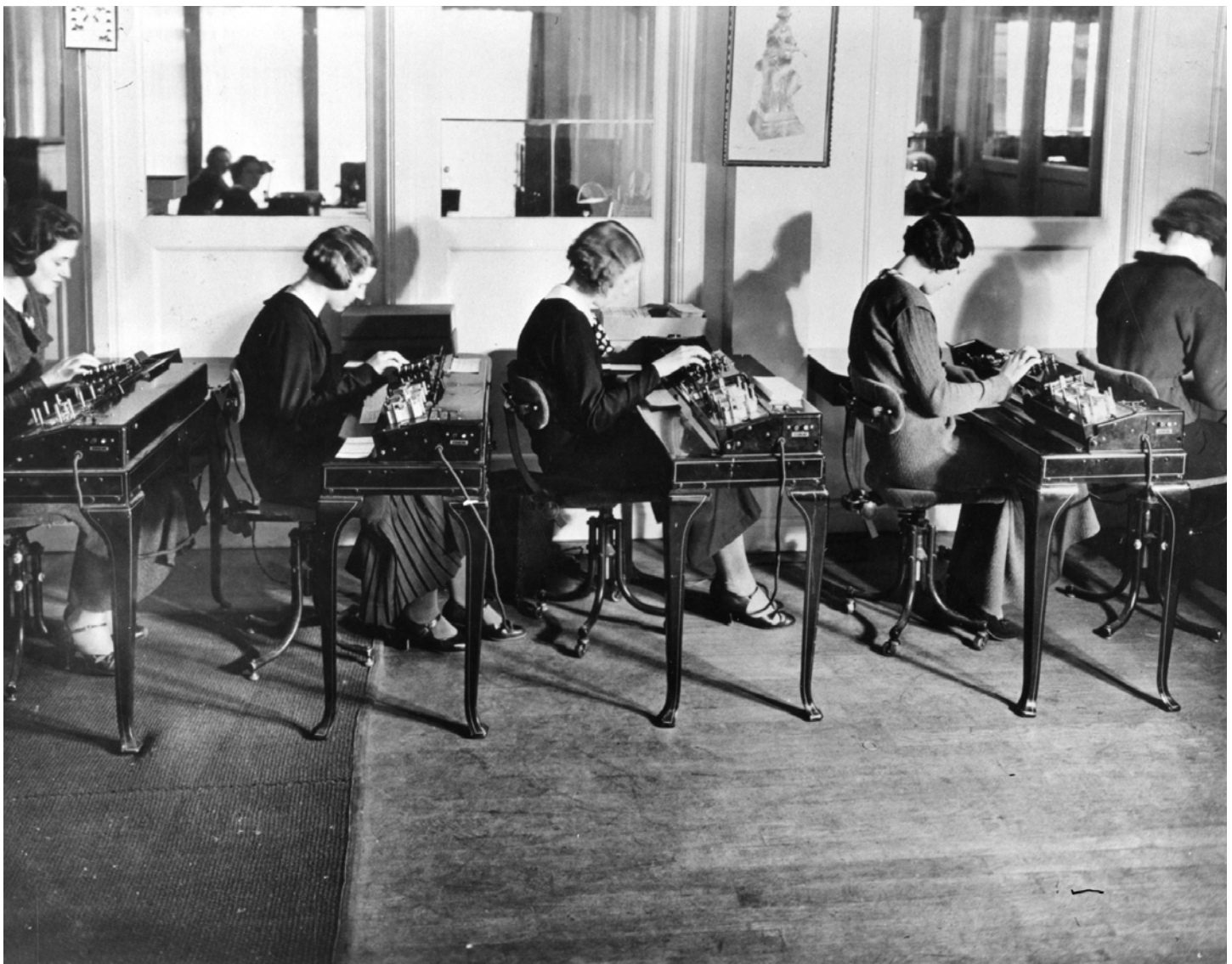
Keypunch operators at IBM in Stockholm in the 1930s. IBM

Once the first generation of personal computers, like the Commodore 64 or the TRS-80, found their way into homes, teenagers were able to play around with them, slowly learning the major concepts of programming in their spare time. By the mid-'80s, some college freshmen were showing up for their first class already proficient as programmers. They were remarkably well prepared for and perhaps even a little jaded about what Computer Science 101 might bring. As it turned out, these students were mostly men, as two academics discovered when they looked into the reasons women's enrollment was so low.